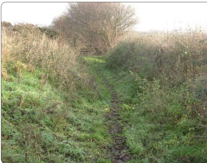
View along the Medieval Road

The old Donyatt to Ilminster road started in Church Street, Donyatt, passing via Down and Dunpole Farms crossing the southern slopes and shoulder of Herne Hill and then down to the Cross (the area of the Royal Oak in Ilminster). This was a convenient way to Ilminster and perhaps the shortest distance from the centre of the village. It is likely to have been a better drained road and less muddy in winter than the lower route via Sea. This road was probably used for taking pottery to Ilminster market using the Stibbear/Crow Lane route. The road was also used as an access to the field systems on the southern slopes of Herne Hill which were used by the local inhabitants. There was a Quaker Burial Ground situated along the route.